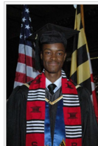
Ib received the Citation of Distinguished Scholar from BCCC